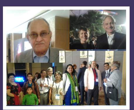
Stalwarts of Radn. Onco. & guests at Meet