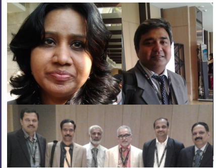
Looking forward to a great conference