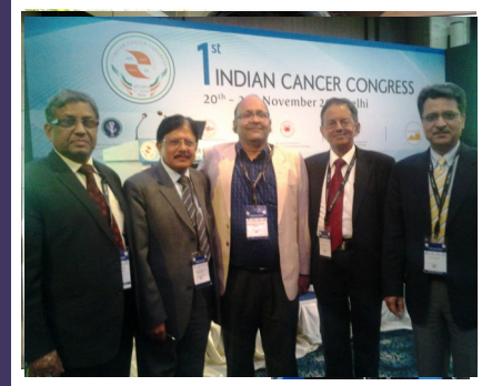
1st ICC hosts with 2nd ICC (2017) hosts