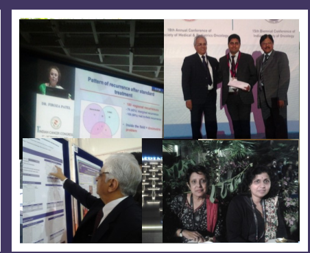
Sessions and celebrations