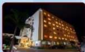
Classic Grande Hotel, Imphal